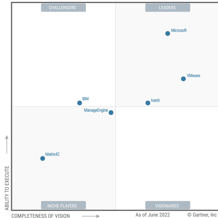
Figure 1: Magic Quadrant for Unified Endpoint Management Tools

“Leaders exhibit strong execution and vision scores and exemplify the suite of functions that assist organizations in managing their mobile devices and PCs. Leaders also provide guidance and tools to help migrate from traditional client management to modern management , as well as deep integration with endpoint analytics and endpoint security tools to provide a simplified IT administrator and an improved employee experience.”